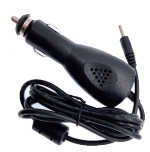
5V3A Car Charge