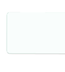
TP Resist film