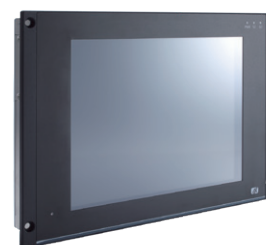
▲ Touch without keypad version