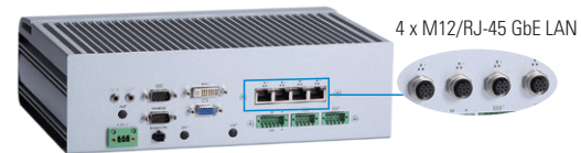
▲ Rear view