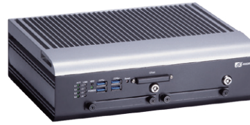
▲ Front view