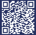
RUT200 360° VIEW