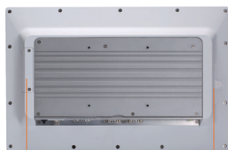
Smart card reader cover ▲ Rear view CFast™ cover