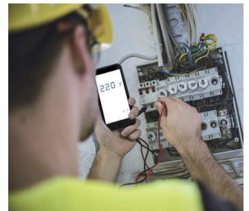
Electric Power Inspection