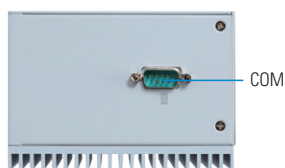
▲ Bottom view