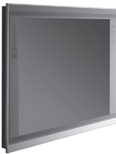
▲ Ultra-slim mechanism design