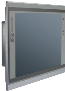
▲ Ultra-slim mechanism design